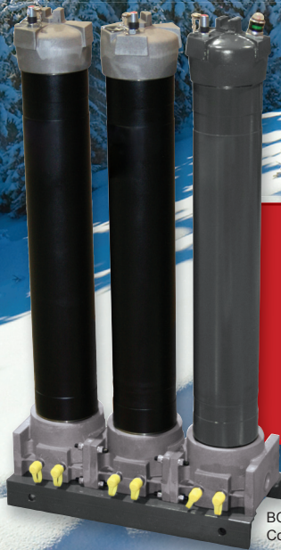
BCC 100 Cold Clear™ Unit

© 2011 Schroeder Industries. All Rights Reserved