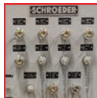
QD Port Panel