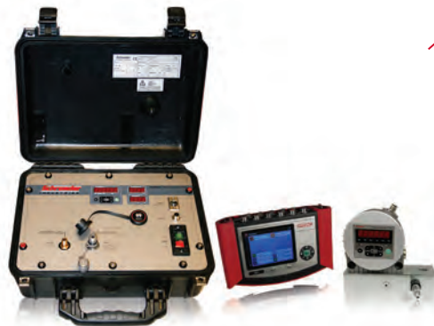
TMU HMG TCM