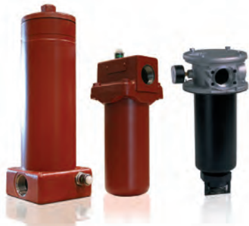
KF30, KF8, RT